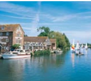
Meadows at West Holme Ford and Bridge at East Holme Wareham Quay