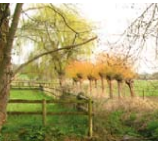
Cottages at Throop Church at Moreton Ford at Turnerspuddle