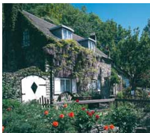
Corfe Castle Village The Blue Pool Cottage at Corfe