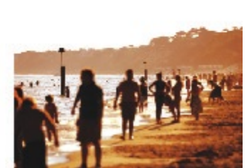
Feel good Factor

"Situated on the sunny South Coast of England, Bournemouth is a year-round cosmopolitan resort."