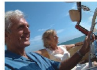
Feel good Factor