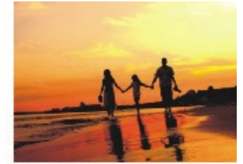
Feel good Factor