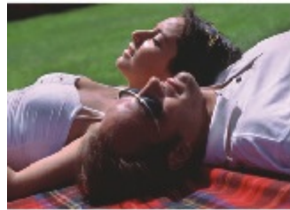
Feel good Factor